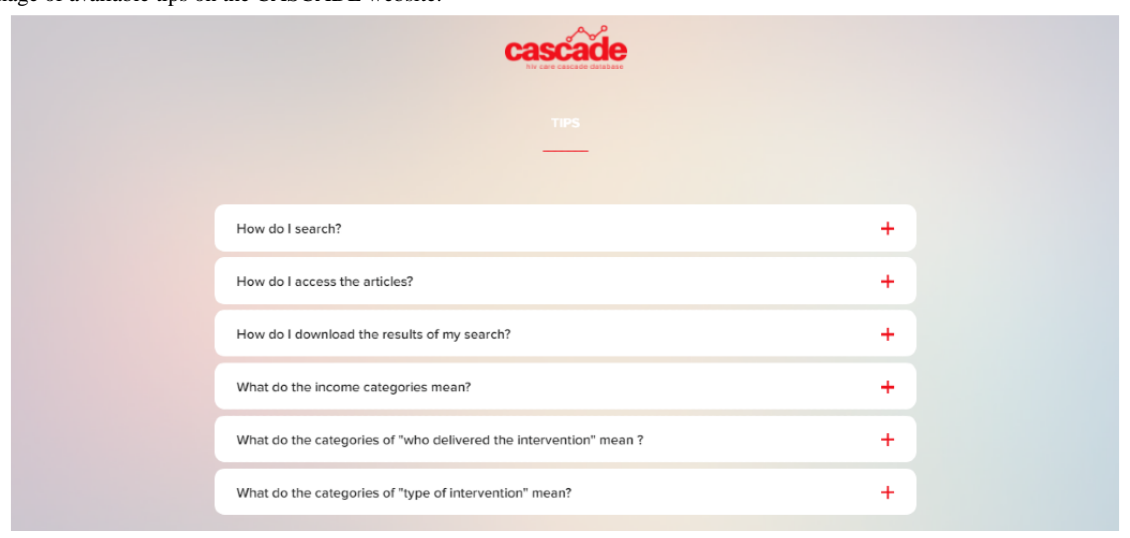
Figure 2. Image of available tips on the CASCADE website.

On the tips page, we display information on how to use the database and the types of trials that are included in each category. The layout of the tips page is shown in Figure 2.